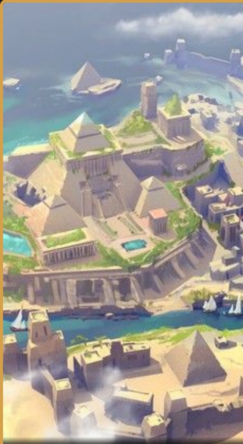
"City of Nyanko Inspiration" Art by Runescape