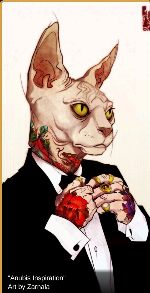
"Anubis Inspiration" Art by Zarnala